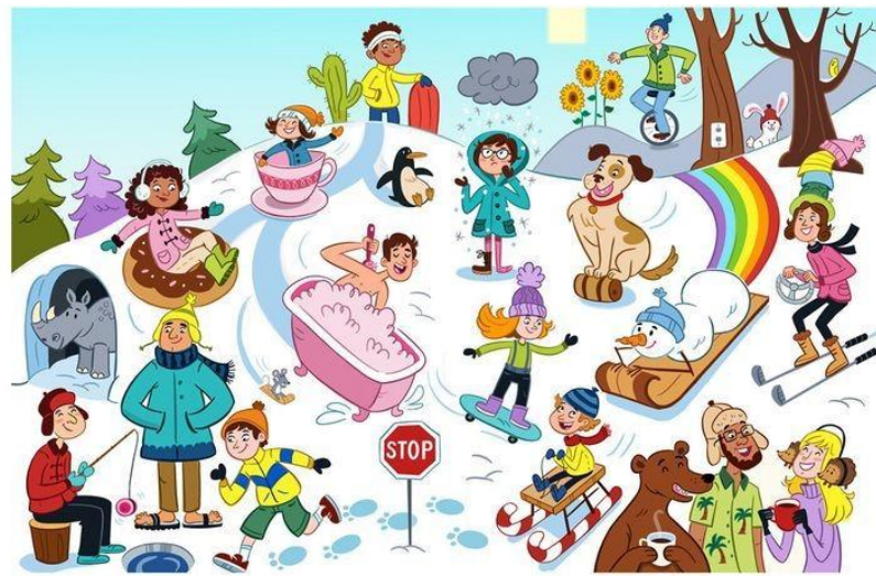
Silly Slide Client: Highlights Puzzlemania