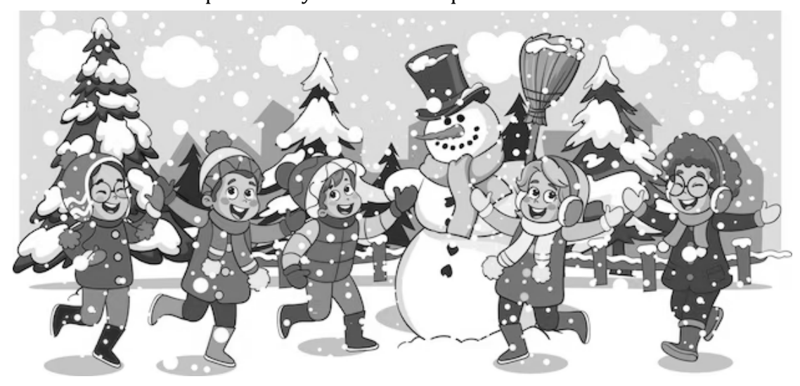
Step 4: Have the student ask you three questions about the picture. Suggested sentence: "Great! Now, please ask me three questions." Please give brief and relevant responses to your student's questions.